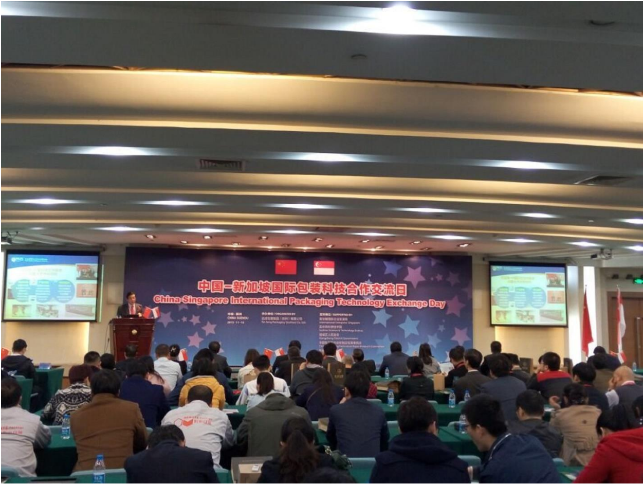
Meeting site (speech)